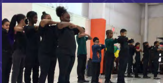
The Original Dreamers Step Team personified the spirit and meaning of our school's Black Excellence Showcase.