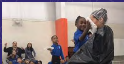
Teachers took a pie in the face from scholars "whipping up" excitement about growth on the NWEA-MAP math and reading tests.