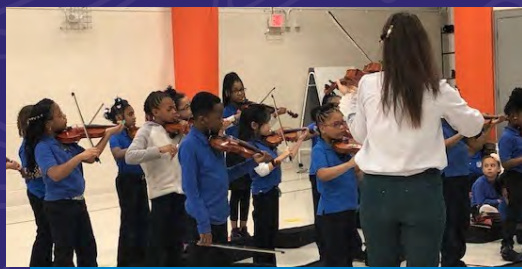
Scholars in grades 1-3 learned to play violin thanks to an afterschool program provided by the Rainey Institute.