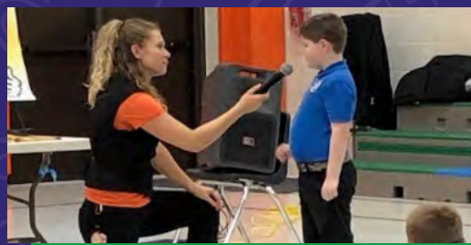
The NED Show visited our school, kicking off a year-long focus on the GROWTH mindset which encourages never giving up even when things seem impossibly hard.