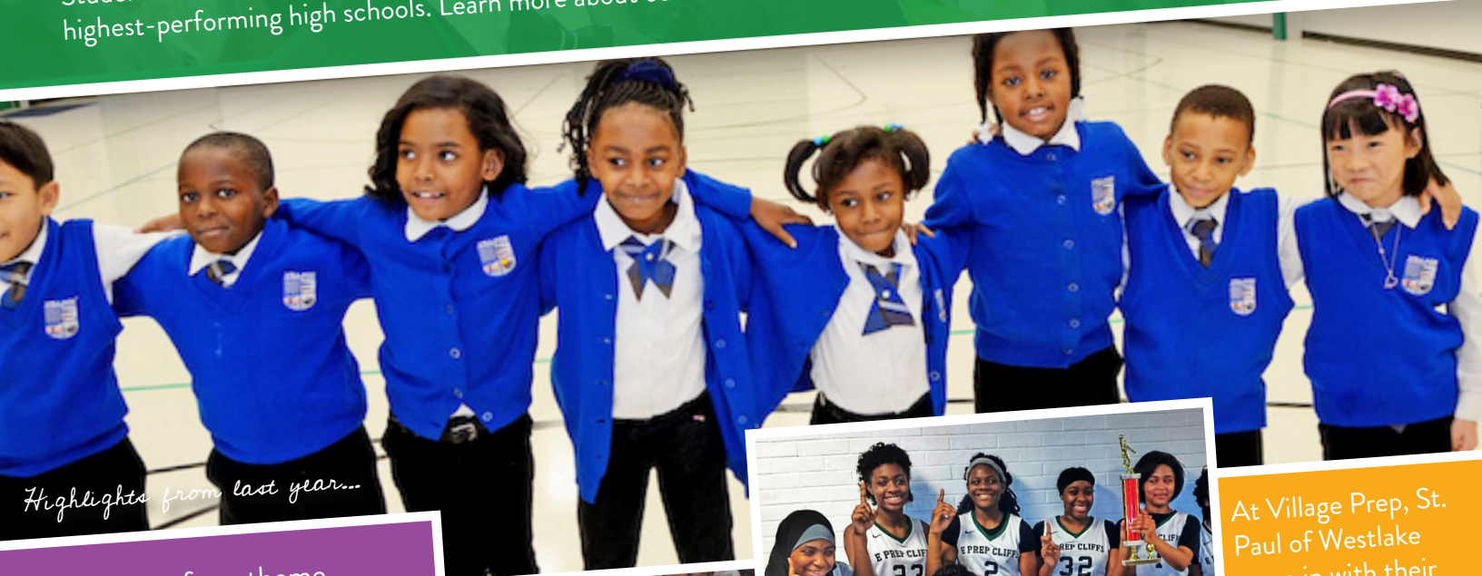
Highlights from last year...

Our flagship middle school E Prep opened in 2006, and our flagship elementary school Village Prep opened in 2009. Our K-8 campus serves more than 700 scholars and is located in the up-and-coming Tyler Village development. Students are held to high standards of academic and behavioral performance to prepare them for some of Cleveland's highest-performing high schools. Learn more about our school and our latest year in this report!