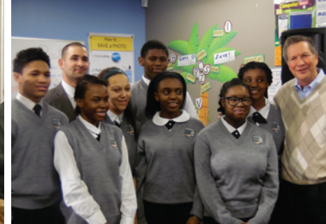
Governor Kasich Visits Breakthrough!